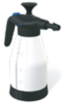
Table and bar top sanitation made easy with this ergonomic alternative to traditional trigger sprayers. Spray in any direction, even upside down. $71.99